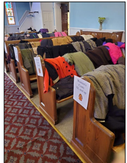
Coats for distribution