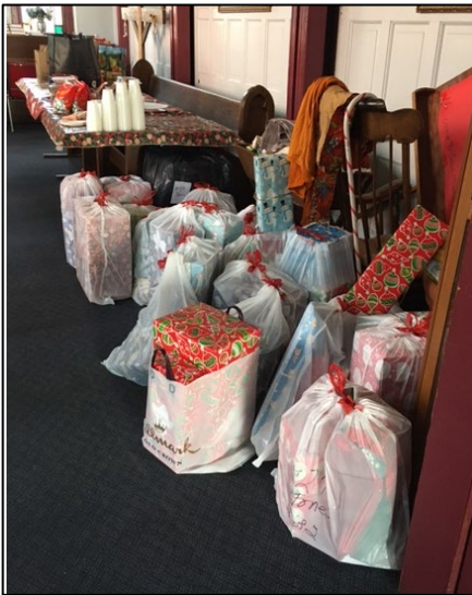
Gifts & Food Baskets

Your generous spirit showed the love of Christ to many!