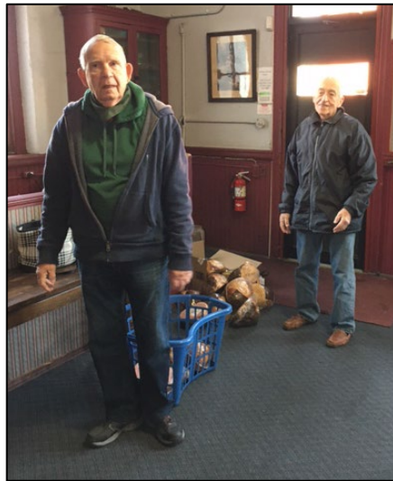
Bringing in hams